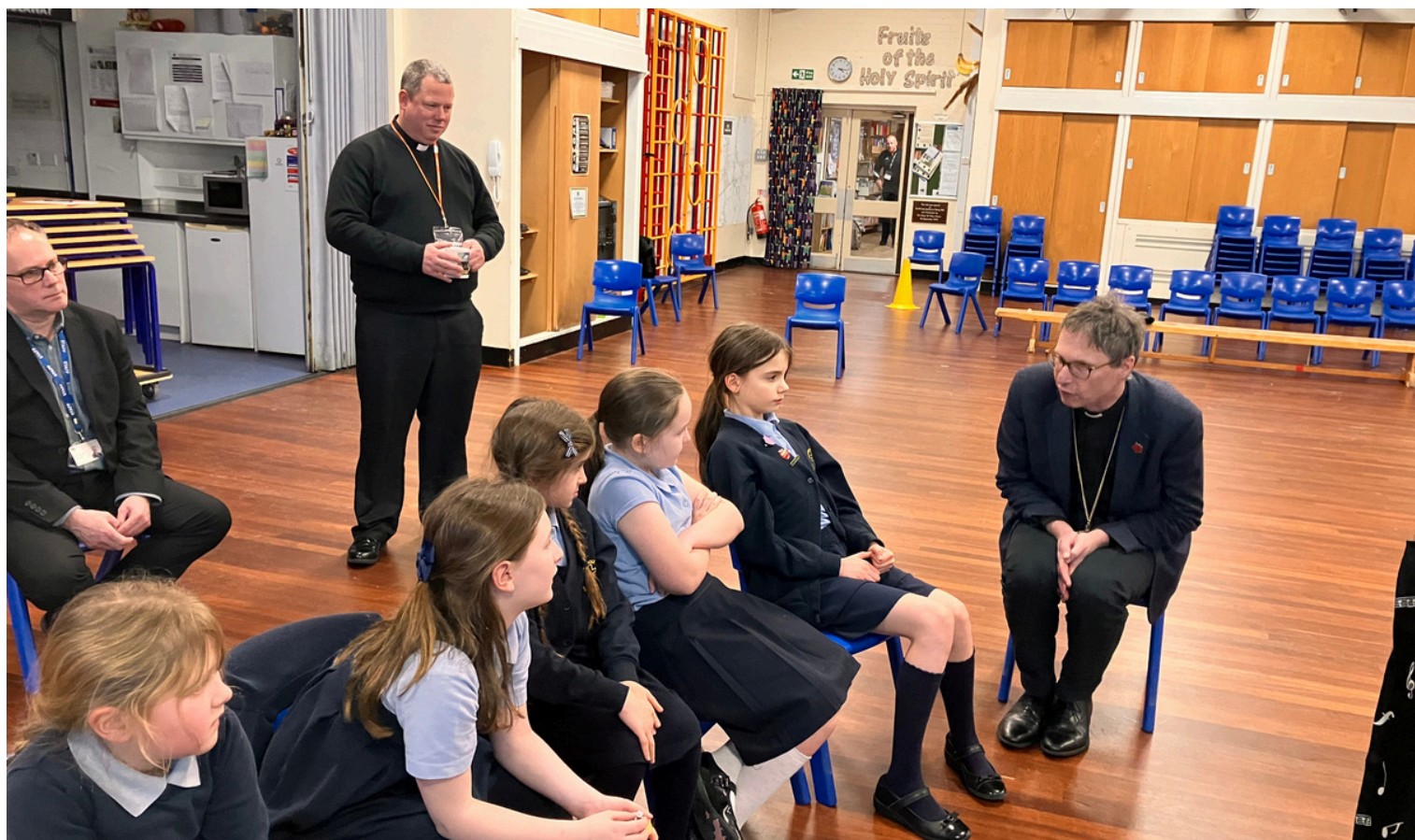
Bishop Philip drops in on Choir Church