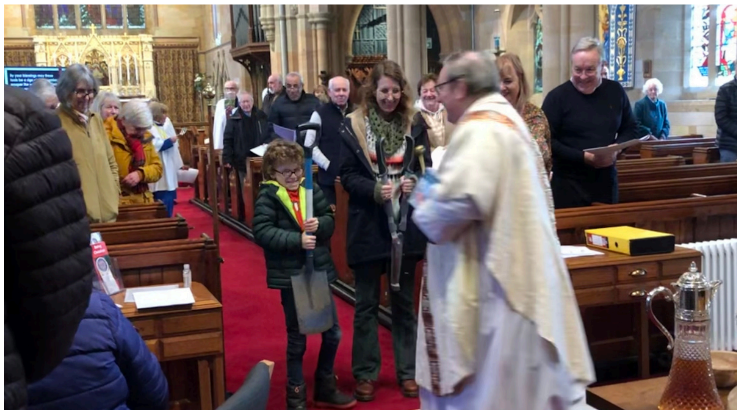
Plough, Garden implements and seeds blessed